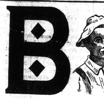
Stands for BLACKS, of this there's no doubt. The black on these faces will never wash out; For wool, silk and cotton, Black Diamond Dyes Are used without fear by the prudent and wise.