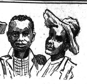
Stands for BLACKS, of this there's no doubt. The black on these faces will never wash out; For wool, silk and cotton, Black Diamond Dyes Are used without fear by the prudent and wise.