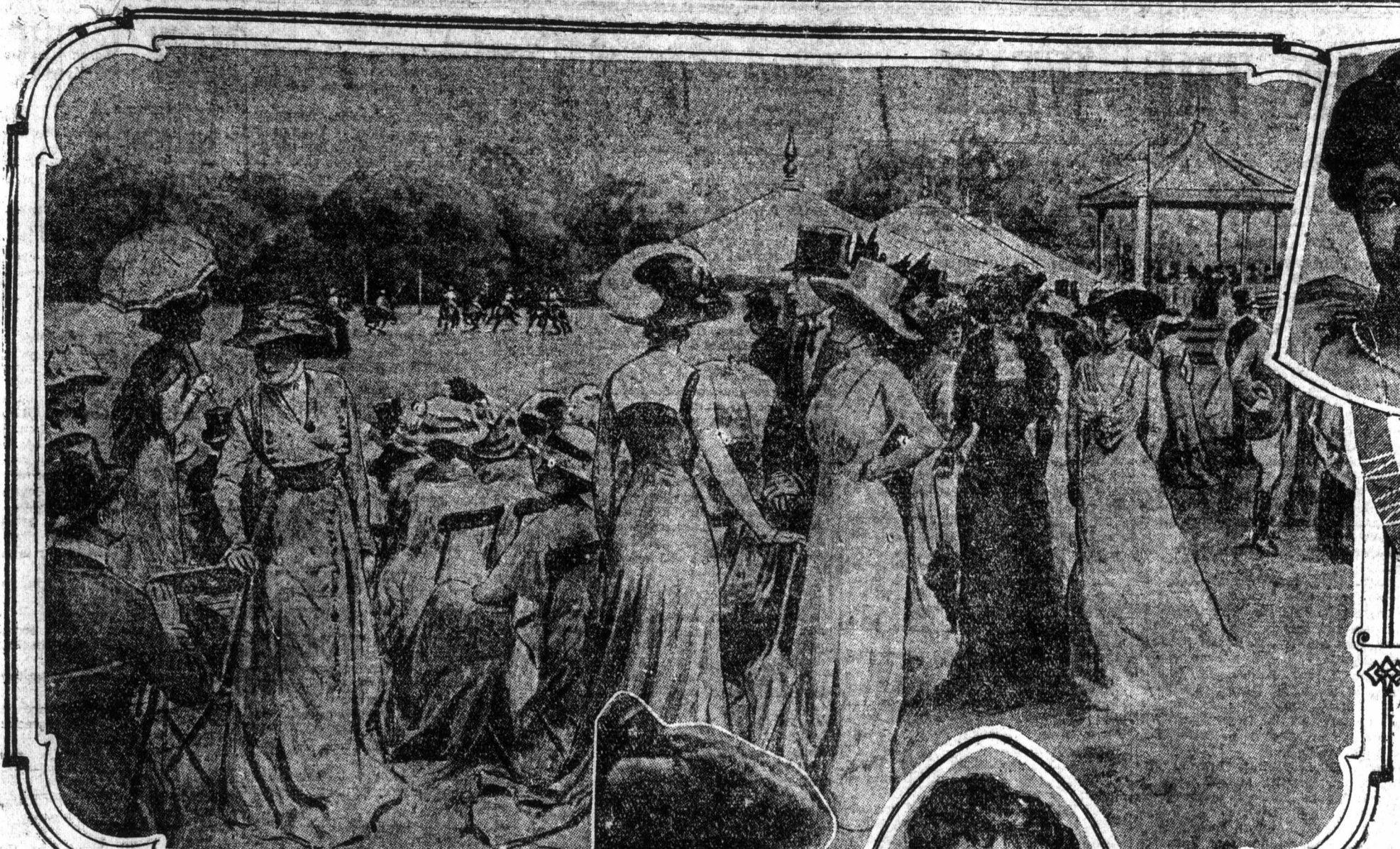
Fashionable Crowd at International Polo Match