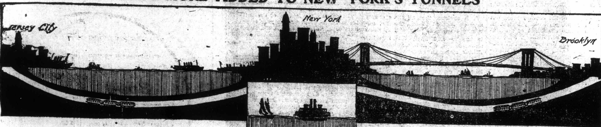
Cross section of Hudson Tunnel