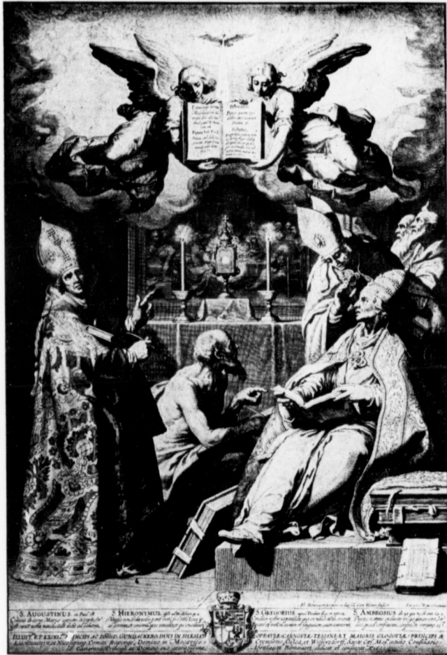
The Four Great Doctors of the Church Proclaiming the Mervels of the Eucharist.