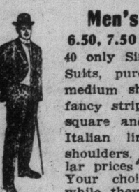
Men's Suit Special

Little by little our enormous overstock has been diminished by the large demands due to our matchless offerings. Day by day the throngs of fortunate purchasers have carried away their share of the plunder, until the show rooms have resumed their normal appearance. This phenomenal selling has left an exceptionally good variety of broken lines, which we will clear at prices which will not leave them long on our hands. Some of these lines we have grouped together for Monday, and, unless mention is made below to the contrary, the range of sizes is complete in each lot, but not in each pattern. Remember these are all this season's newest styles, made in our own workrooms from the very finest all-wool materials, imported direct from the mills of England and Scotland.