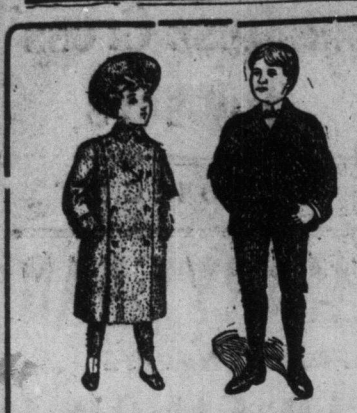
"Boys, you're just Simply splendid"

If We have pleased you by giving an Air Rifle with your suit or overcoat, YOU have more than pleased us with your generous patronage during the past two weeks.