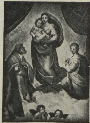
THE SISTINE MADONNA.

had taught him anything of their pride of science and intellectuality. The beautiful and noble lines of the figures, the perfect balance and symmetry of members, the natural grace of the attitudes, the finely spaced and harmonious composition indicate the perfection of a certain phase in art, or at least its approach. For these remain the unique charm of Raphael, although his maturer work, the "Sistine Madonna," the "Transfiguration," and the great frescos of the Vatican, the "School of Athens" and the "Disputa" combine with this Raphaellesque grace more in-