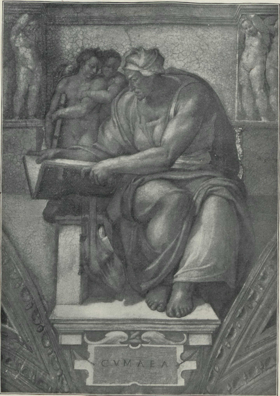
THE CUMÆAN SIBYL.