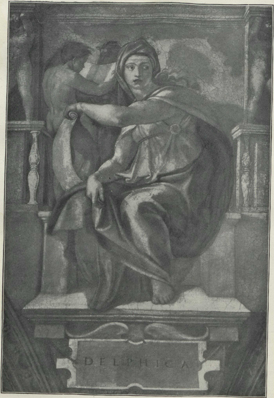
THE DELPHIC SIBYL.