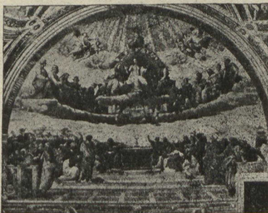
THE DISPUTE CONCERNING THE SACRAMENT.