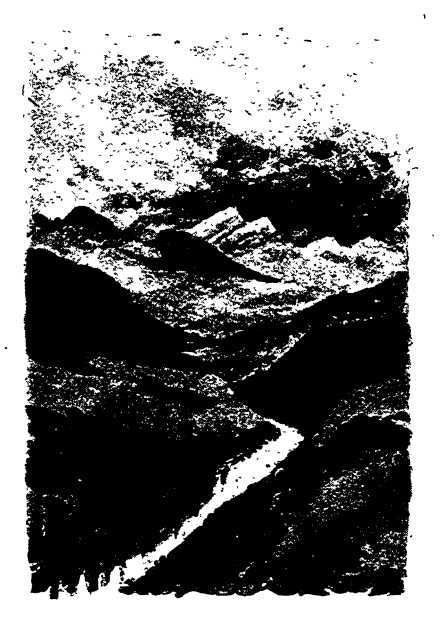
Bow River. Morley