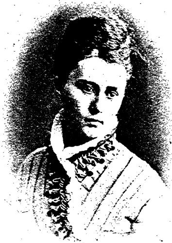
Isabella Valancey Crawford