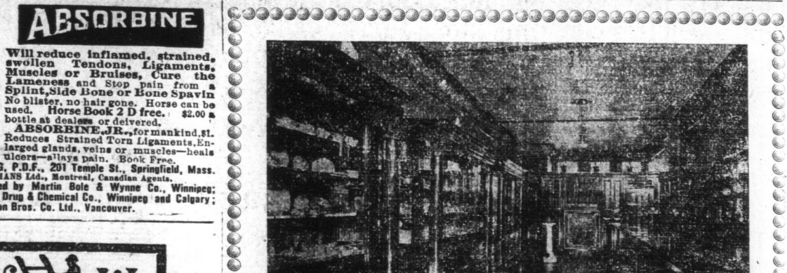
THE HOUSE OF QUALITY

This store is a favorite shopping place. Patrons find here an exceedingly choice display. No line of goods more reliable is carried by jewelers anywhere.