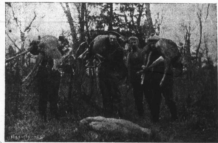
CARRYING OUT THE GAME

MONDAY, Feb. 26.—The snow and rain have made excellent sleighing, it having frozen solid.