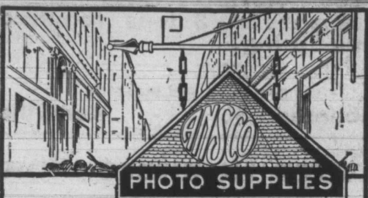
PHOTO SUPPLIES Come Here For Photographic Supplies Our store is the Mecca for all aspiring amateur photographers. Our line of Ansco photo supplies is complete. We have the Ansco, the amateur camera of professional quality, $7.50 to $55.00. And there is the Buster Brown family, $2.00 to $12.00. Ansco Film, the original, genuine and perfect film. Cyko, the prize-winning photographic paper. And best of all is our unequalled guarantee. Come in today. Look for the Ansco Sign.