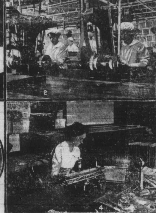
(1) Women Car Cleaners at Work., (2) Turning Fuses. (3) Port McNicoll.