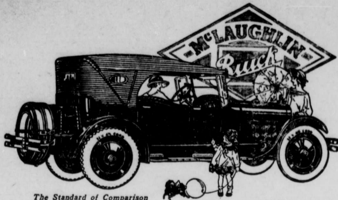
The Standard of Comparison