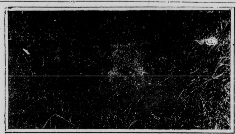
Sly Reynard is not so easily captured as some of the less valuable animals

every den near their route of travel. At the fore part of the trapping season it is advisable to have traps set at every den, whether signs indicate use or not, for many skunks will approach to take a peek in and go on. If the trap is set in front of the eptrance it will be more effective. The skunks are living in one den, as will be evidenced by the numerous and well-defined trails lead.