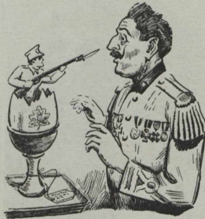
An Easter Egg for the Kaiser FROM "TRENCH ECHO" 27th Batt.

A dispute regarding the chieftainship of the clan arose between the Macclaines of Lochbuie and the Macleans of Duart, the former alleging