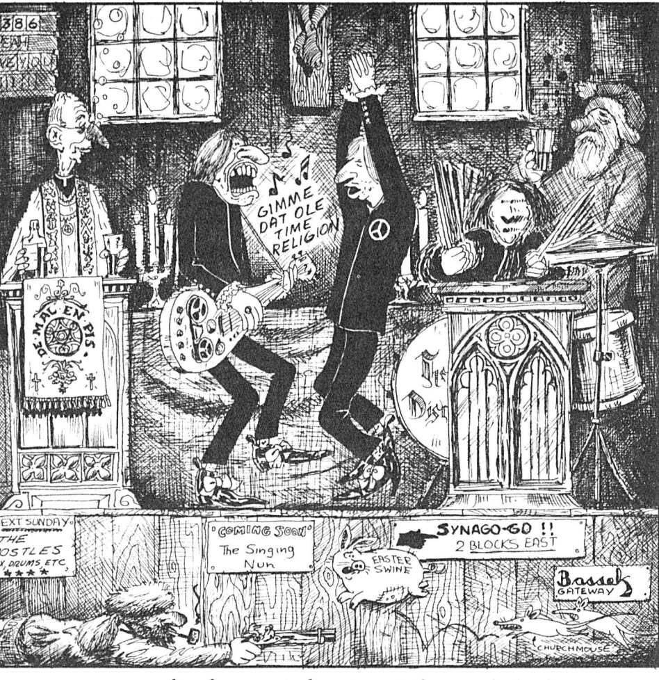
many churches go modern to get the people back