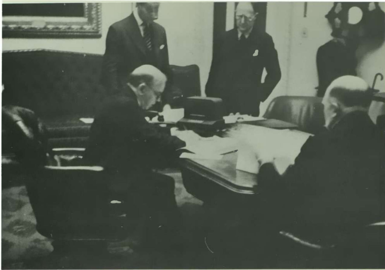
La signature de l'accord du Plan d'entraînement aérien du Commonwealth, Ottawa, le 17 décembre 1939. Assis: King, Lord Riverdale; debout: A. D. P. Heeney, O. D. Skelton.