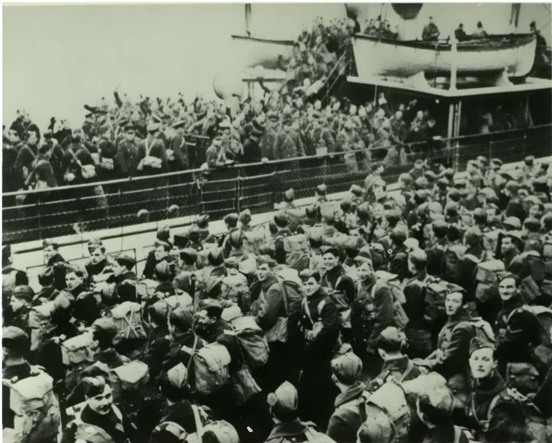
Arrivée de la première Division canadienne en Grande-Bretagne, décembre 1939.