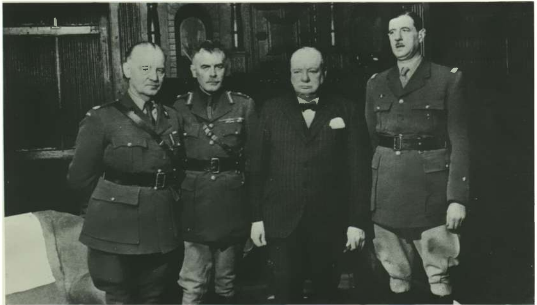
Des visiteurs éminents au quartier-général du Corps d'armée canadien, Headley Court (Surrey) 1941. De g. à d.: le général Sikorski, le lieut.-gén. A. G. L. McNaughton, Winston Churchill, le général Charles de Gaulle.