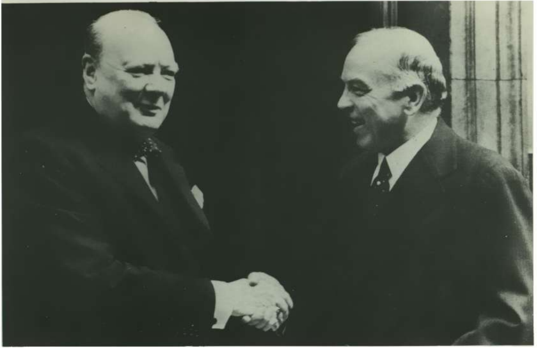
Les premiers ministres Winston Churchill et W. L. Mackenzie King à Londres, septembre 1941.