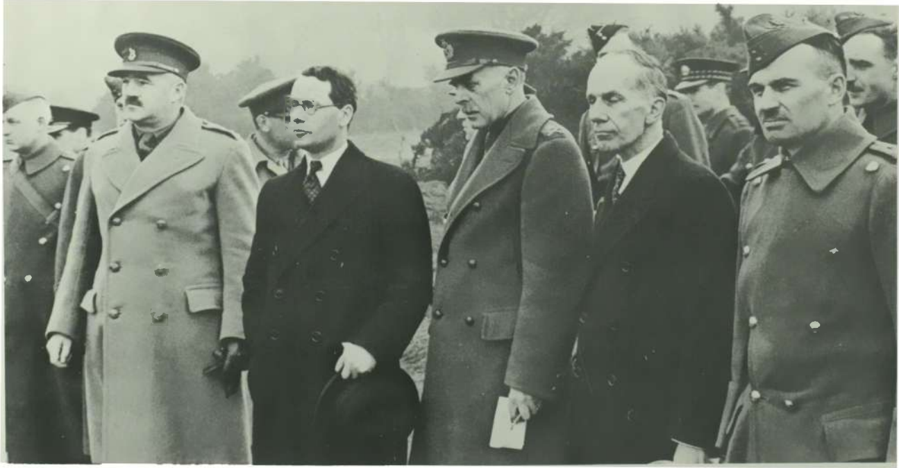
Malcolm MacDonald visitant les troupes canadiennes en Grande-Bretagne, en 1941, avant d'assumer le poste de haut-commissaire au Canada. Au centre en partant de g.: MacDonald, le lieut.-gén. A. G. L. McNaughton, Vincent Massey.