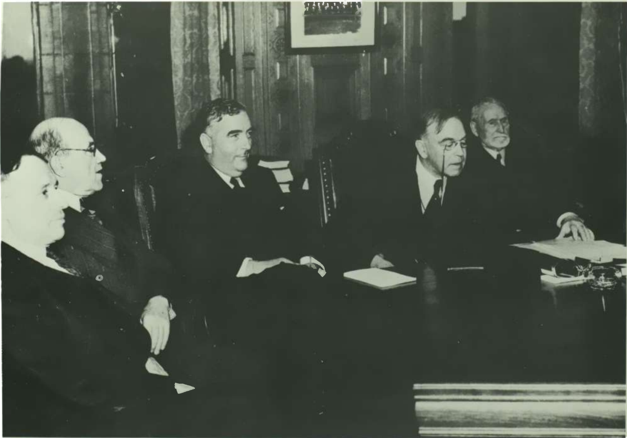
Le premier ministre d'Australie, R. G. Menzies, à une réunion du Cabinet, Ottawa, mai 1941. De g. à d.: J. G. Gardiner, Ernest Lapointe, Menzies, King, et le sénateur R. Dandurand.