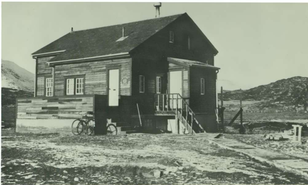
Le consulat canadien, Godthaab (Groenland). La plaque consulaire se trouve près de la porte.