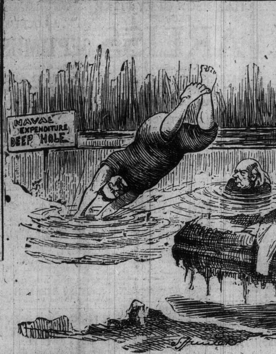
GEORDIE FOSTER: Aw, shoot, I thought Bob Borden was again 't' stay out an' tie up that duck Laurier's clo'es.