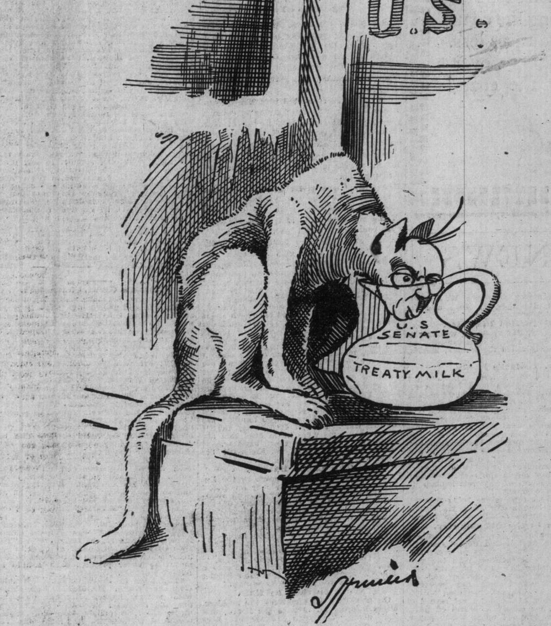
OUR OWN TABBY: If the neck wasn't so blame "narrow," I might get somethin' out of it.