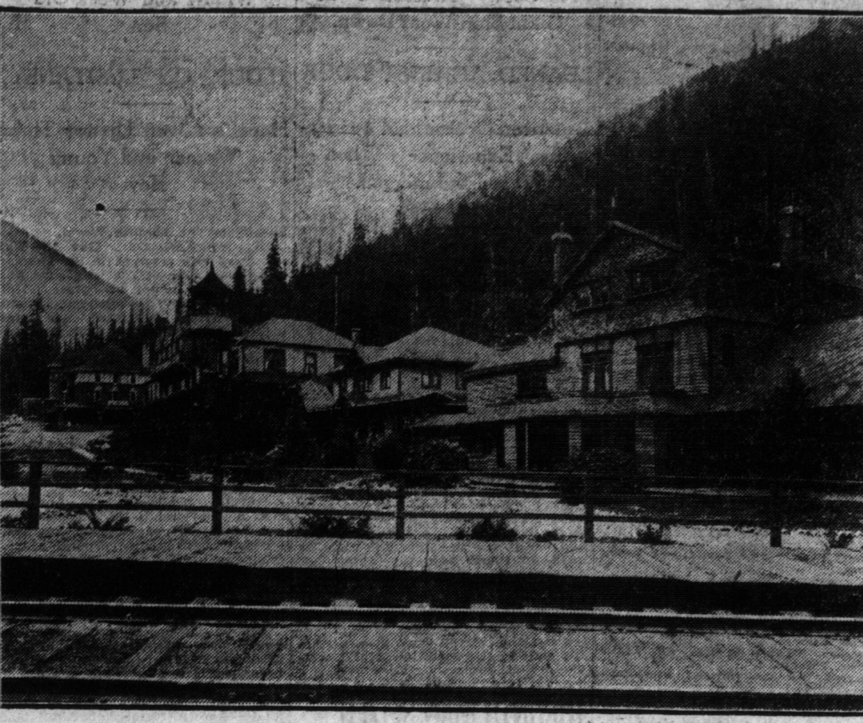
Glaeder, B.C., under Mount Sir Donald, on the line of the C.P.R.