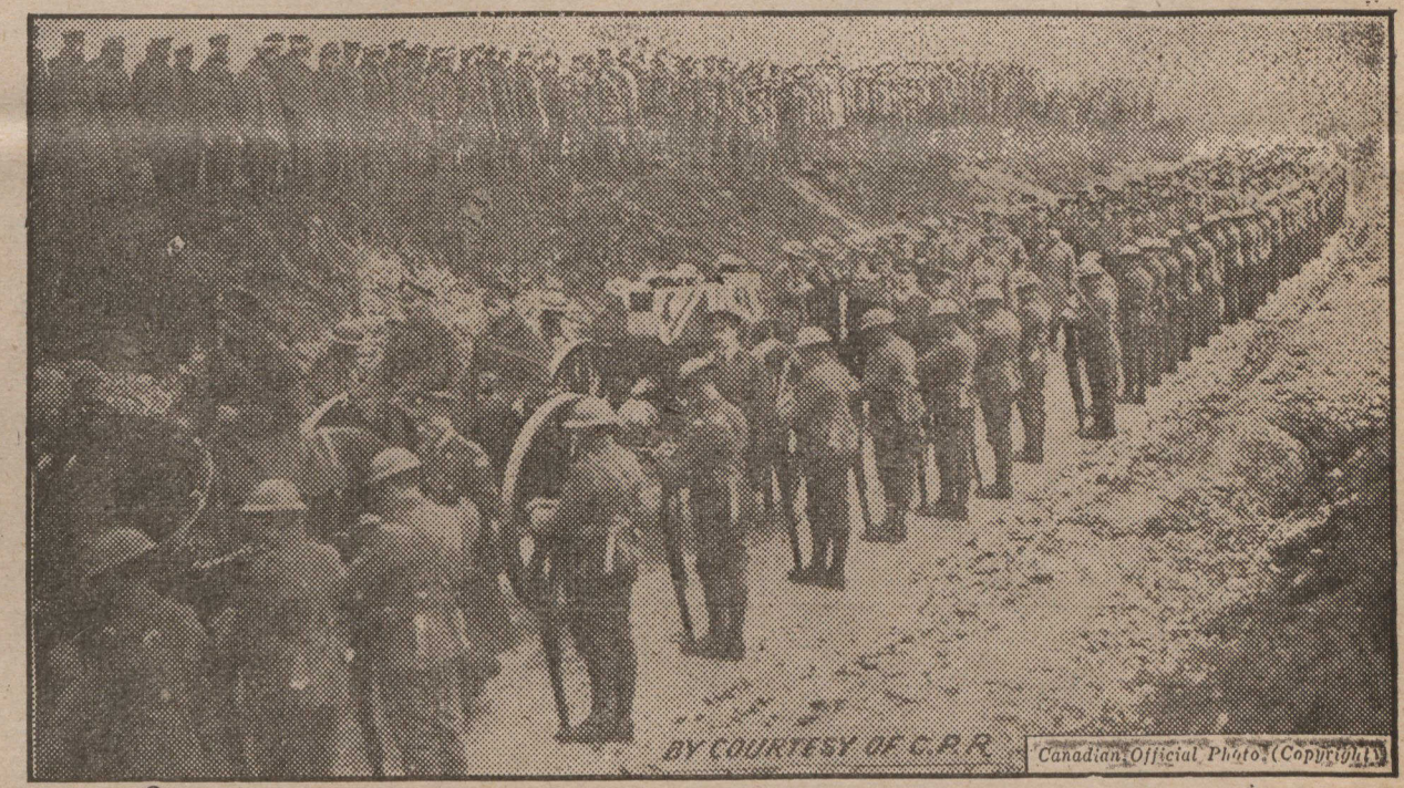
Funeral of General Lipsett near the line. The cortege passing between men of a battalion which the general brought to France. H.R.H. the Prince of Wales followed the coffin.

"Five past twelve," replied the attendant in a whisper.