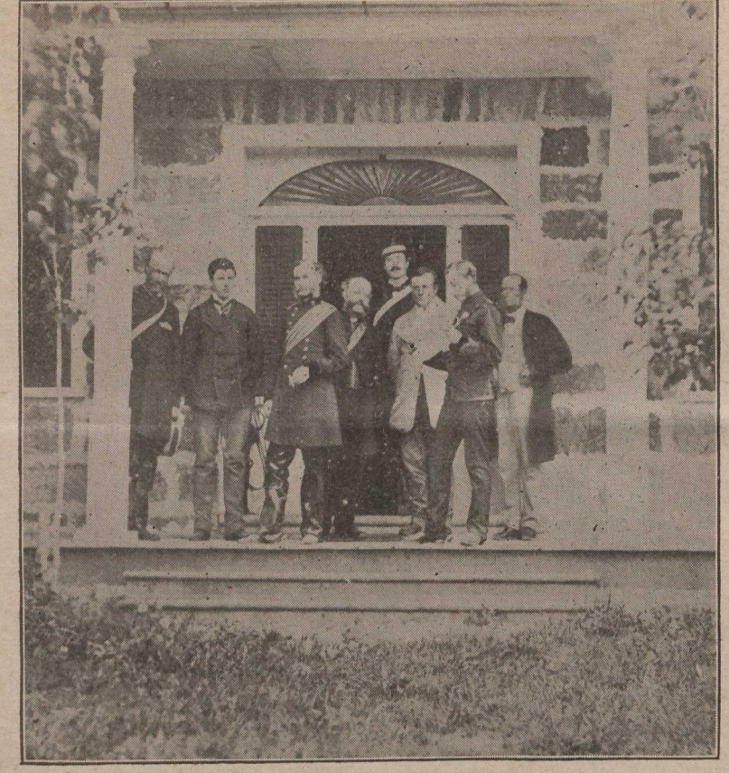
Taken July 1870.

'Knots and Lashings" is printed by the E. R. Smith Co., Ltd. ("The News and Advocate") St. Johns, Que., Can.