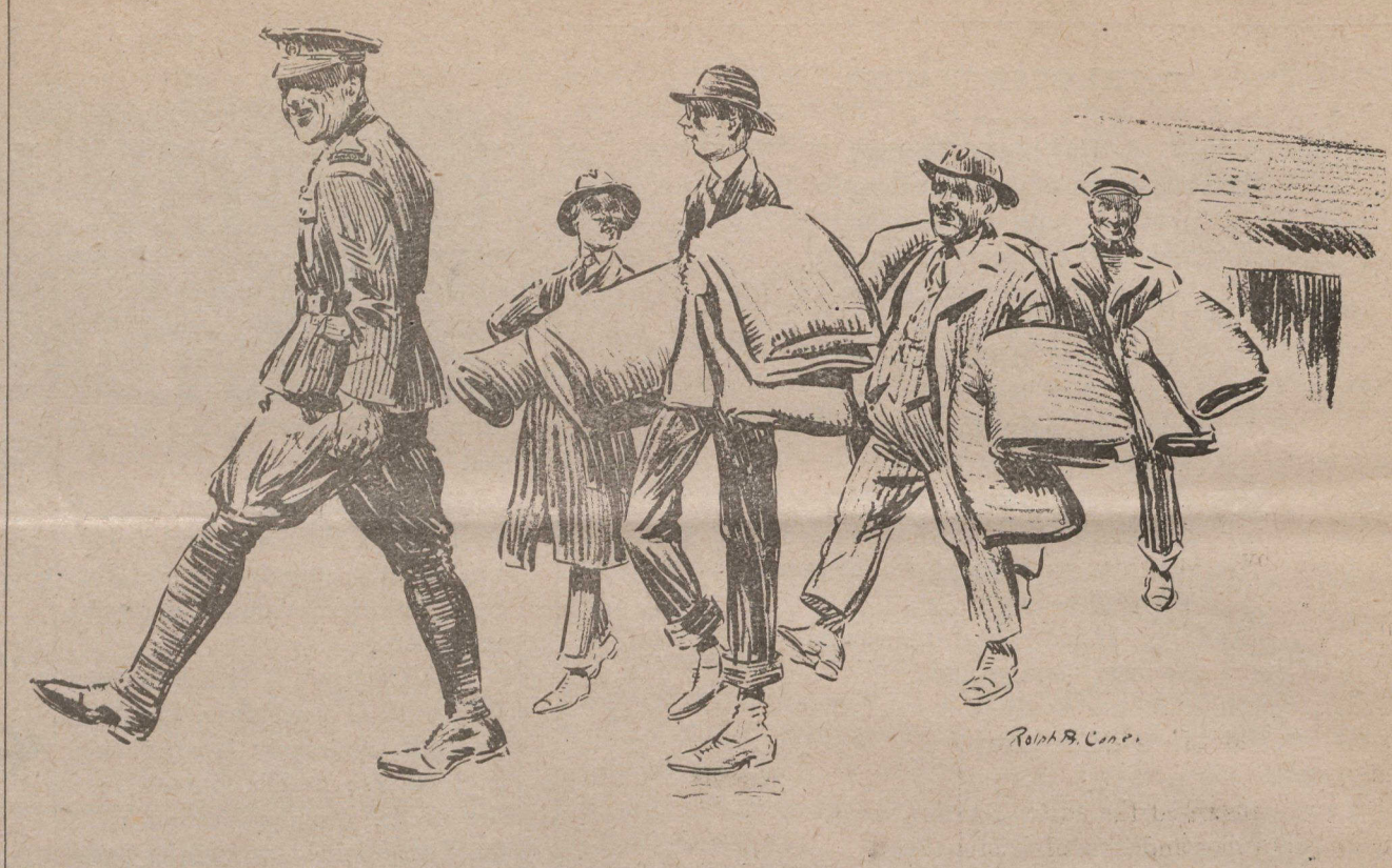
RETURNING OUR ISSUE.

mean," he confided. "I extended me 'orspitality to 'im; I 'ad 'im in 'ere, gave 'im a jolly good dinner, and a first-rate bottle of wine -one of the best in my cellar. Now this'll show yer what 'e is; that was a fortnight ago, and up to now 'e 's never recuperated.