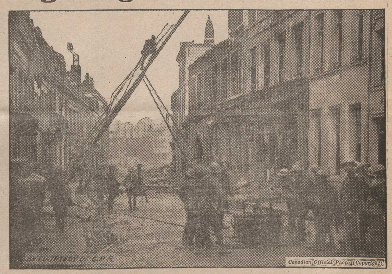
Fighting the fires started by the Germans.