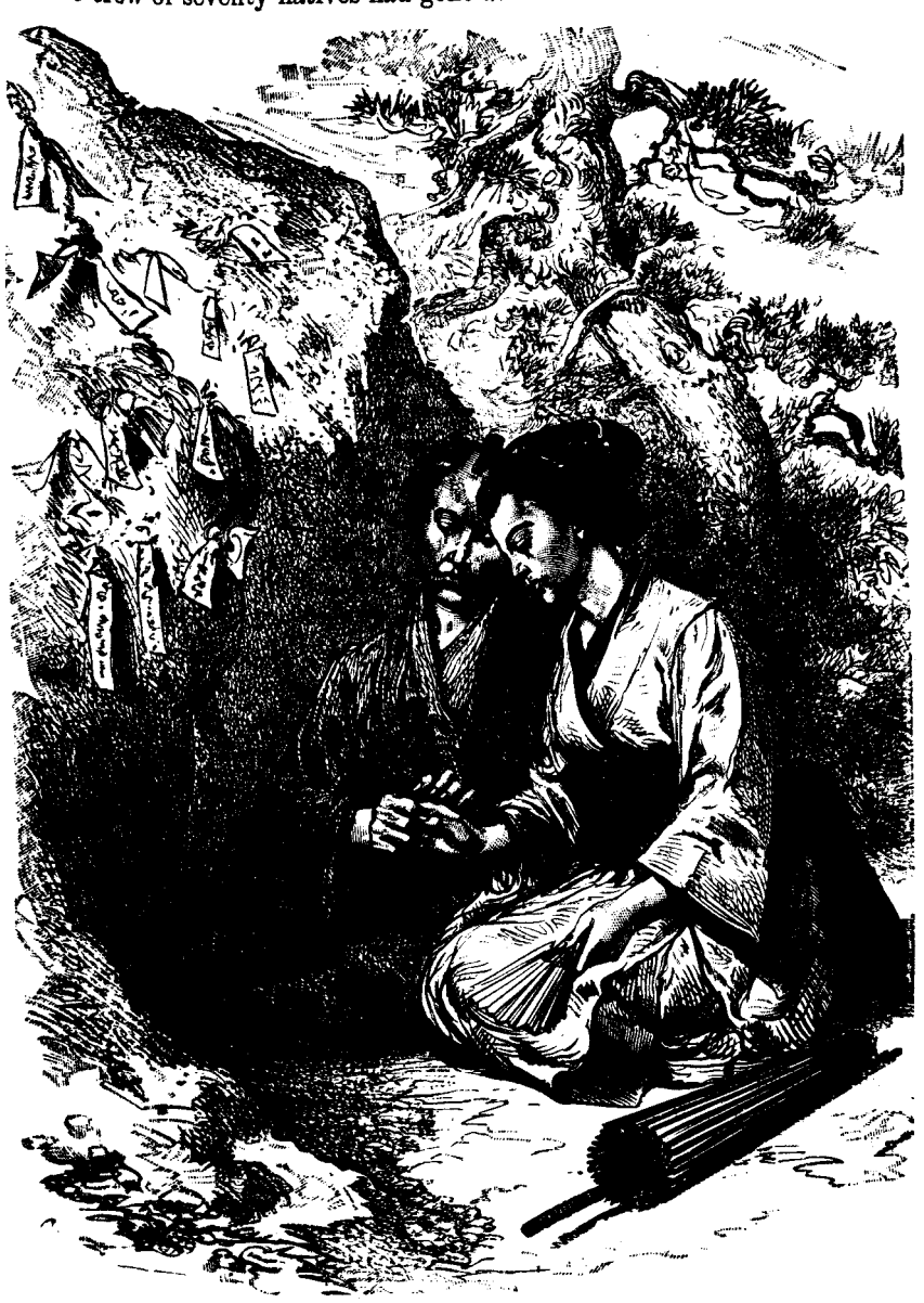
THE LOVERS ROCK.

pose all the ammunition had been heaped together in the hold. Most of the crew of seventy natives had gone ashore in the boats, and were