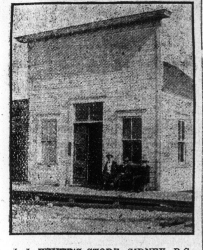
J. J. WHITE'S STORE, SIDNEY, B. C.

DR. B. J. KENDALL CO., 711 E. 104th St., New York, Sept. 8, 1903.