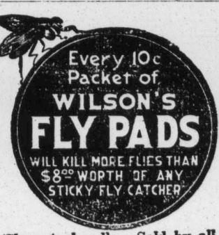
Clean to handle. Sold by all Druggists, Grocers and General Stores

The New Brunswick fire prevention ber of applicants for the position.