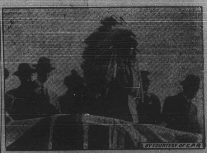
The Prince Wearing Indian War Bonnet and Making a Speech at Banff.