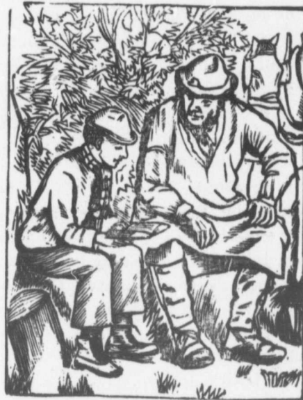
YOU, ME, OR ANYBODY ELSE.

JONATHAN EDWARDS when a boy, wrote in his journal, "Resolved to live with all my might, while I do live."