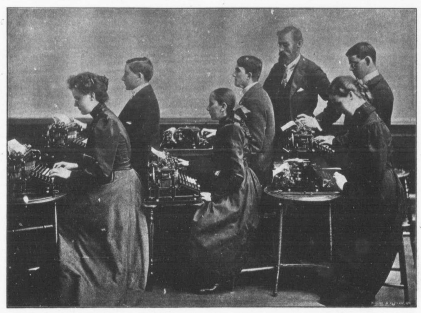
LEARNING TO OPERATE THE TYPEWRITER Ontario Institution for the Blind, Brantford

The class rooms were the first places visited. Here regular school work is in progress every week day. Geography and History are the two subjects in which blind pupils usually do best, as their memories are excellent. The maps are made of movable pieces of wood put together very much in the same way as toy puzzles. Rivers and railway lines are marked by raised lines, and towns and cities by little raised points.