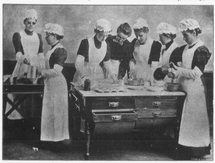
THE CLASS IN COOKING Ontario Institution for the Blind, Brantford

But the layman is plainly a man of affairs. He is not immured in a study. His companions are men, not books. The layman lives amid the storm and stress of professional, commercial, or industrial life. In the shop, at the forge, in the