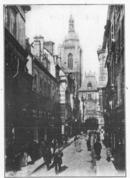
A STREET IN ROUEN, FRANCE