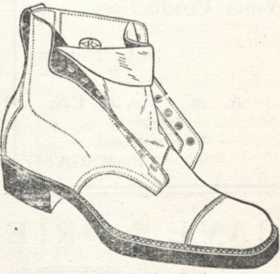
"K" Service Boot

ONE SHILLING = THREE MONTHS SUBSCRIPTION, MAILED ANYWHERE