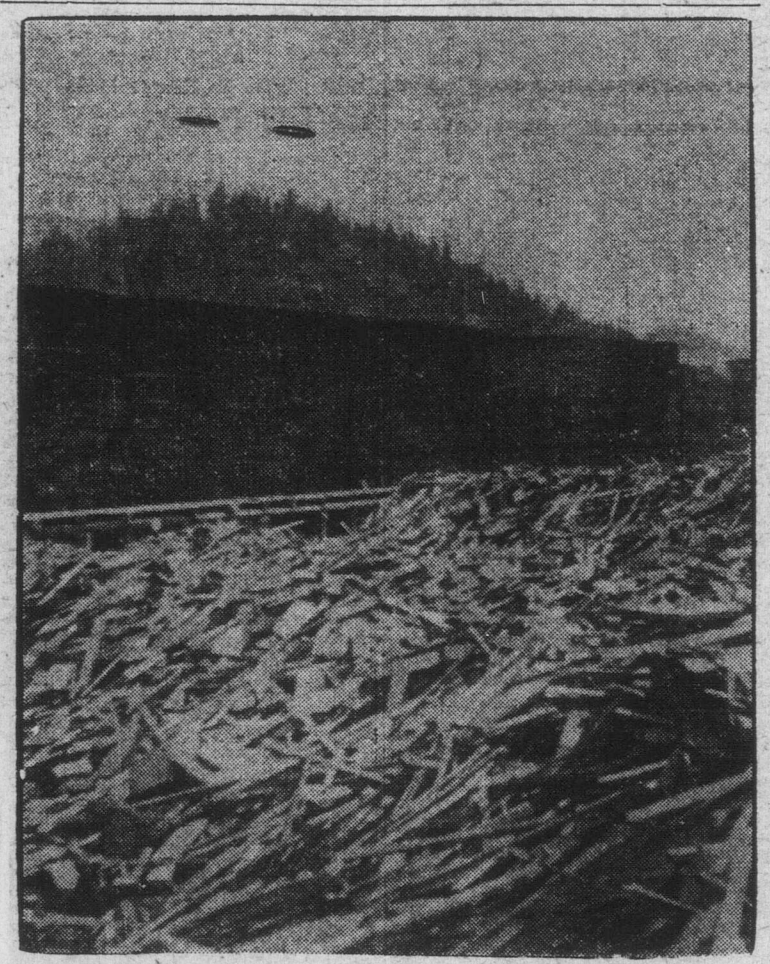
IMMENSE PILE OF SHINGLES WHICH COLLAPSED AT MOSQUITO