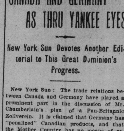
New York Sun Devotes Another Editorial to This Great Dominion's Progress.

New York Sun: The trade relations between Canada and Germany are the prominent part in the discussion of Mr. Chamberlain's plan of a Pan-Britanic Zollverein.