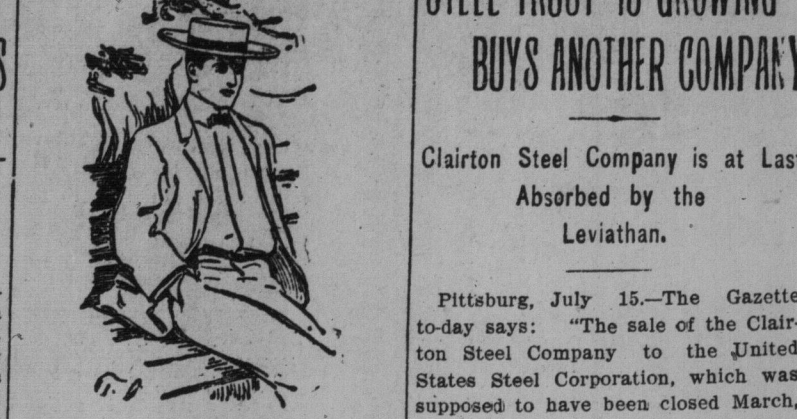
Clairton Steel Company is at Last Absorbed by the Leviathan.

Pittsburg, July 15.—The Gazette today says: "The sale of the Clairton Steel Company to the United States Steel Corporation, which was supposed to have been closed March, has at last been consummated.