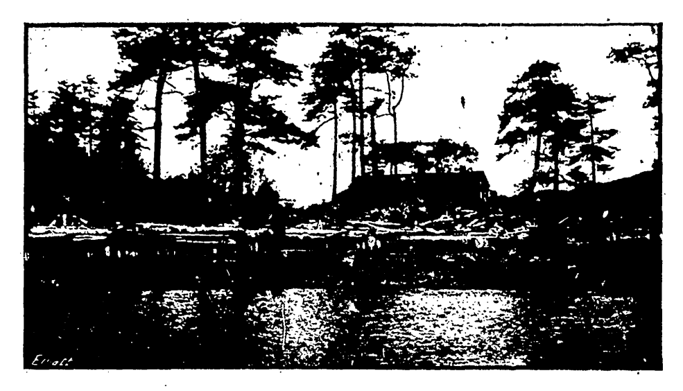
FIG. 1.-THE LAZARETTO FROM THE BOAT, D'ARCY ISLAND.