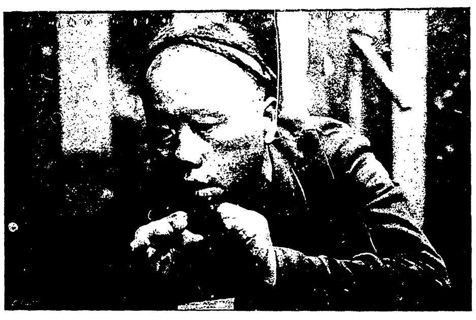
LEPERS OF D'ARCY ISLAND