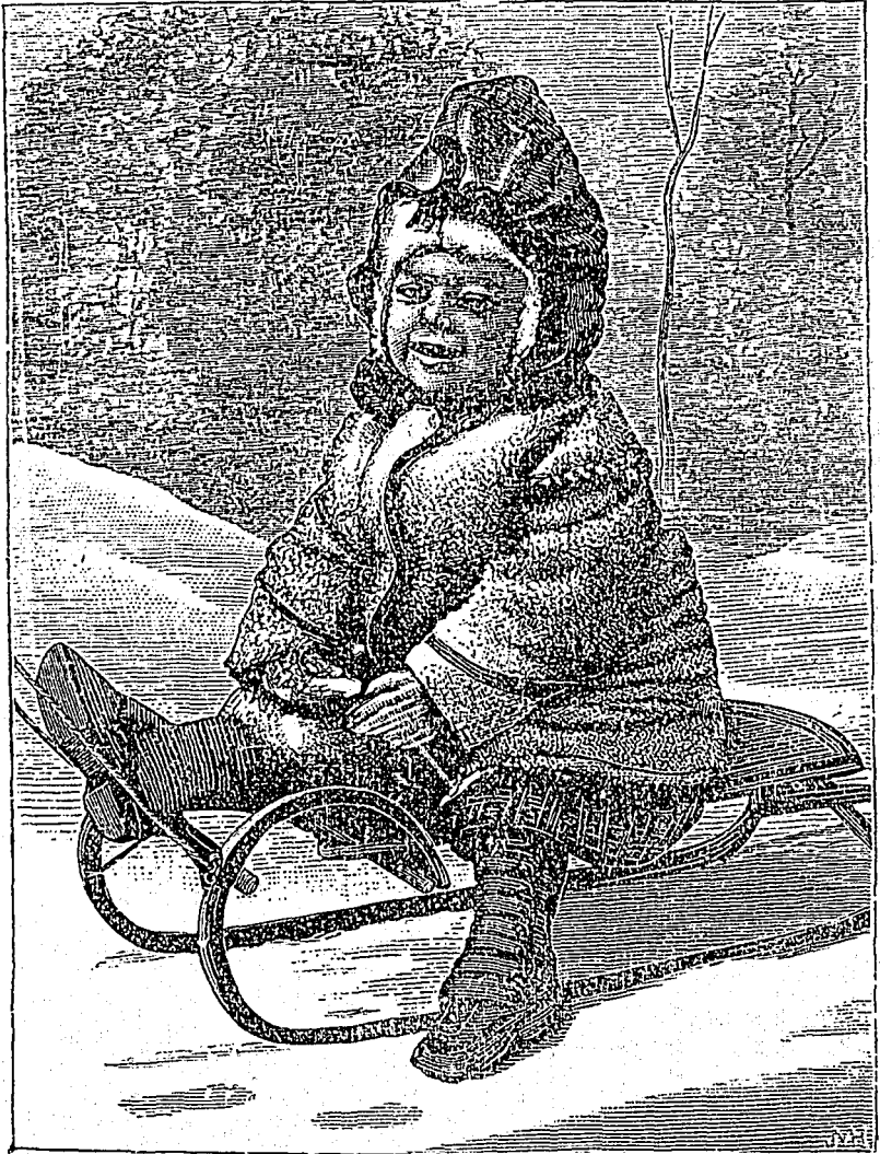
A HAPPY NEW YEAR.