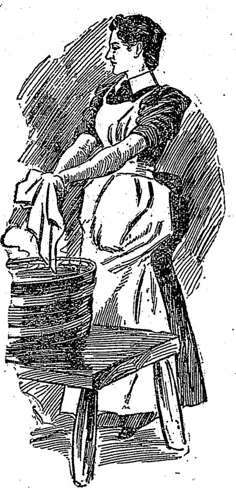
'THERE STOOD THE BEAUTIFUL MISS LIVINGSTONE.

As with flushed face and reluctant steps