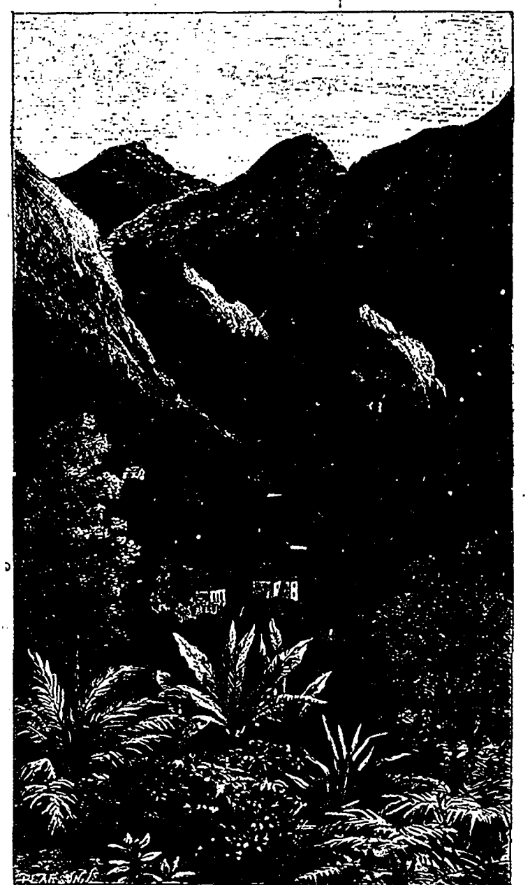
VALLEY OF THE BLUE MOUNTAINS, JAMAICA.

swept over Jamaica, causing sad havoc among the churches, and this formed the basis of an urgent appeal which the new bishop made for help in his work. The construction of the Panama canal suddenly opened up a field of missionary work which it was exceedingly diffi-