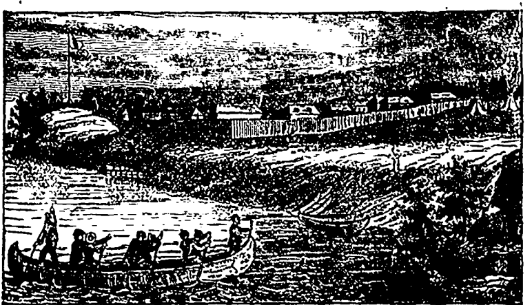
A STATION OF THE HUDSON'S BAY COMPANY.

plain groceries came only once a year, and then only if ordered two years beforehand. Sometimes they were three years on the way, ard sometimes failed to arrive at all. A few vegetables were grown in favourable seasons, but often none were available for winter use; and flour was so scarce and costly that bread was to be had once a we k as a treat. However, food such as it was, was plentiful, moose and reindeer meat, rabbits and fish forming the staple food. In starving years which came now and again they were often sadly pinched. Archdeacon Kirkby had prepared a little