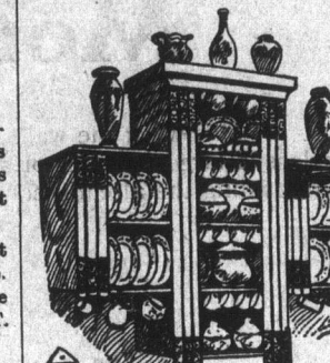
THIS SHELF WERE FINISHED.

How to Make and Decorate One That is Both Pretty and Useful. Much cheer may be brought into a small apartment by the method of furnishing. It is a mistake to get the conventional 'suits,' especially where means are limited and the furniture must necessarily be ordinary.