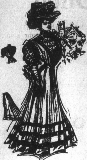
NOT BROWN VOLE—5673, 5322.

Hints For the Trouseau—Coats of Dyed Lace—Neck Ruff Smart. The bride who is wise will include in her wardrobe all the fancy jewelry she can afford to buy.