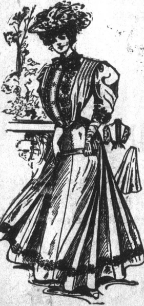
A STYLISH LINEN GOWN—5624, 5564.

Panama Hats Very Smart For Morning Wear—Blouse Traveling Suits. The scarf trimmed panama hat is in most of its forms a rather youthful type of headgear, but when cleverly bent and trimmed it is peculiarly piquant for morning wear.