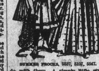
SUMMER FROCKS, 5557, 5107, 5547.

Princess bloomers to wear in place of skirts are new in the underwear section. Heavy satin ones lined with china silk are $14.50, and those of pongee and mohair are much cheaper.