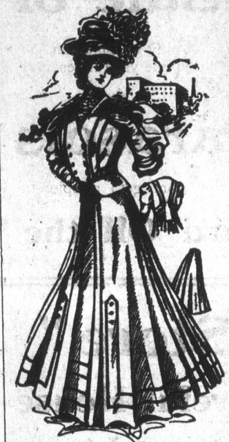
A POWERFUL SUIT—5674, 5511.

Medish Shoes of Bronze and Patent Leather—Kimono Tendancies. A complete departure from previous styles of colonial ties are those of bronze or patent leather with a strap buckling across the base of the tongue.