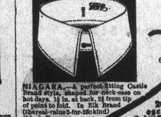
NIAGARA—A perfect-fitting Gaiter Brand style, shaped for neck-case on hot days, 15 in. at back, 21 from tip of point to fold, in Elk Brand (this is value for 20c kind) 20c each.

Some people have a repelling expression in their faces and manner which is a constant embarrassment to them, but they do not seem able to overcome it. This is largely due to a lack of early training or to the fact that sometimes these people have been reared in the country, away from the great centers of civilization, where they do not have the advantages of social intercourse, and in consequence become cold and appear unsympathetic when they are really the opposite.