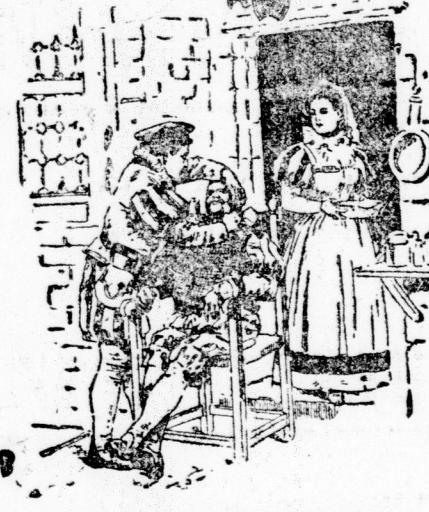
SHAVING IN "OLD" ANTWERP.