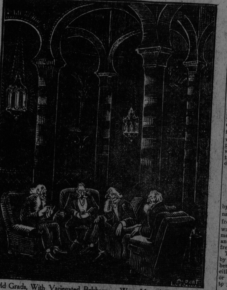
Four Old Grads, With Variegated Belshazzars, Were Massed Together in The Egyptian Room Trying to Fix The Date on Which Dr. Milo Lobosquos Became Emeritus Professor of Saracenic Philobotany

THE NEW FABLE OF THE NIGHT GIVEN OVER TO CARELESS REVELRY