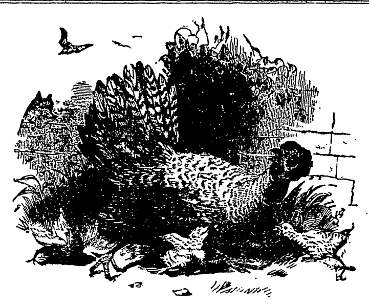
The Domestic Hen.

Bussion states that he once saw a hen hawk alight near a farm house, when a young cock, of less than a year old, instantly darted at him, and threw him on his back. In this situation, the hawk defended himself with his talons and his bill, frightening the hens and turkeys, which screamed at the top of their voice. After the hawk had recovered himself a little, he rose, and was preparing to make off with himself; but the cock rushed upon him a second, time, overturned him, and held him down so long that he was caught.