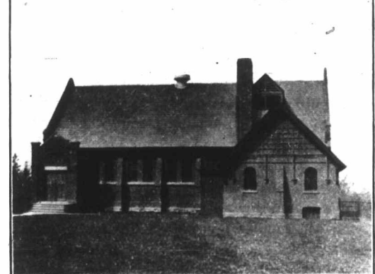
Church of the Epiphany, Toronto.

junior auxiliaries were proposed to be the maintenance of an Indian child, $120; to Foo Chow School, China, $25; kindergarten, Nagoya, Japan, $10. The total amount of the pledges was $917. The report was accepted. The report of the Finance Committee was read by Mrs. Perley. The thank-offering had been increased this year to $275.87. The amount collected during the session was $45.20. The expense was $42.65, leaving a balance of $2.55. On