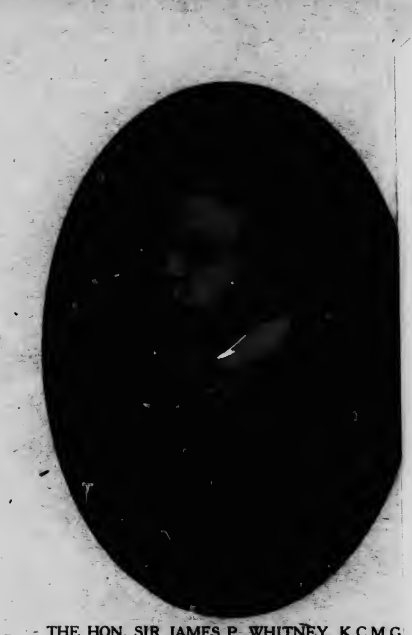
THE HON. SIR JAMES P. WHITNEY, K.C.M.G. Prime Minister of Ontario.