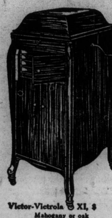
Victor-Victrola 3 XI, 8 Mahogany or oak