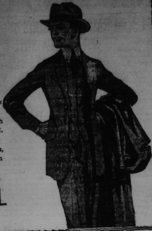
March 5, 1917.