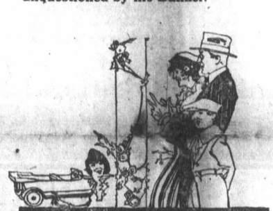
At age 50 he has no fear of hardship for himself or his family.