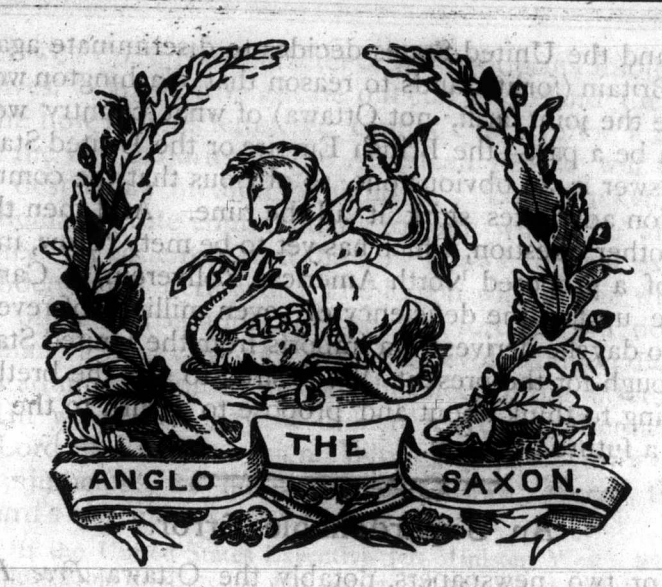
A Monthly Journal devoted to the interests of the Anglo-Saxon race in Canada.