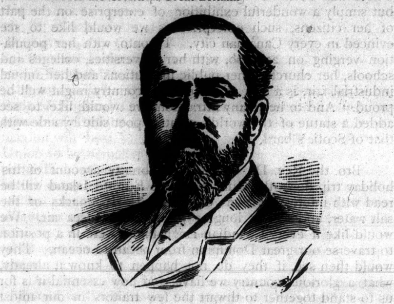
LORD STANLEY. The an longal blue a offer

We are pleased to present to the readers of THE ANGLO-SAXON a photograph cut of Lord Stanley; also a short sketch of the positions he has held under the Crown of Great Britain.