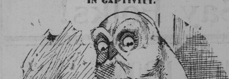
THE OLD TOBY WHITE OWL: Oh, if I only had the liberty I've lost, maybe I wouldn't use my toes on some of them fellows—my vetoes, I mean.

FAIR AND COLDER. Lower Lakes and Northwestern Bays Waterily and northwesterly winds generally fair and colder.