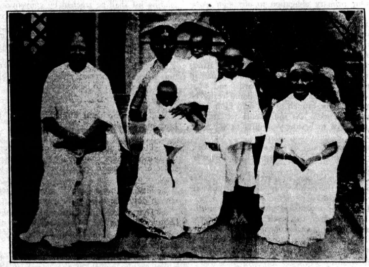
SOME "TELUGU TROPHIES." BIBLE WOMEN See Page 234