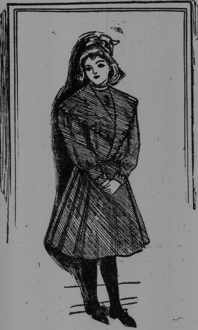
BLOUSE DRESS FOR LITTLE GIRL. A simple and becoming little model is shown in the illustration, the design being suitable for flannel or cloth, linen, or any of the heavier cotton materials.