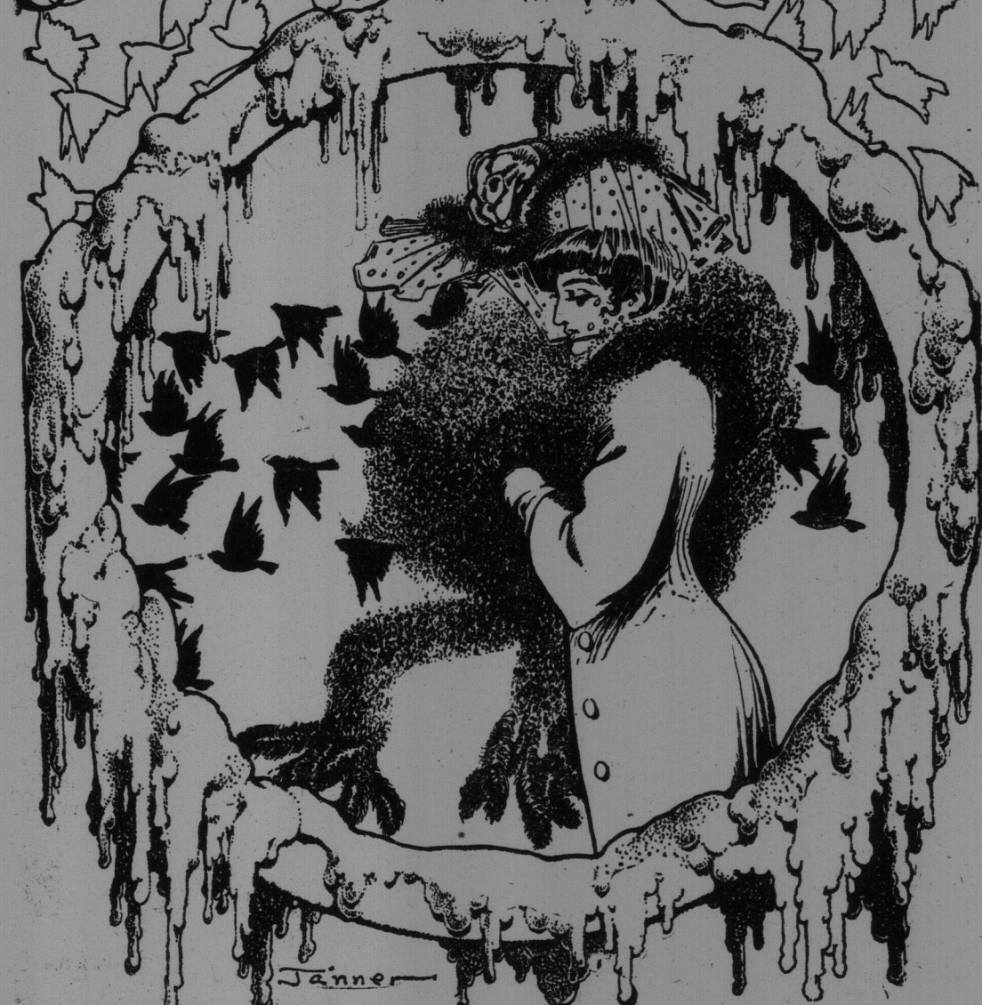
Lines under seasonable weather. Cheer up! We've murmured 'gainst the cold. But such is mortal lot, Eye long we'll prattle loud and bold Because it is too hot.