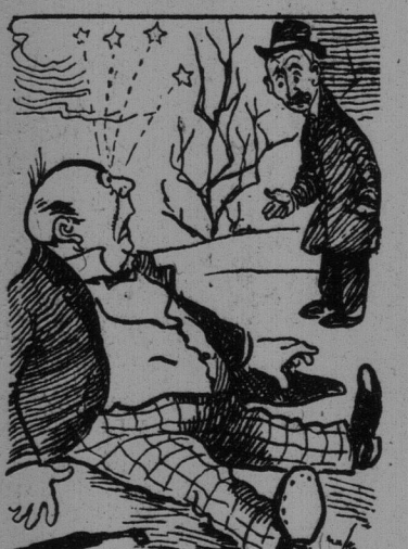
WELL, WHAT DID HE DECIDE. Kindhearted to man who had slipped on the ice—did you fall?