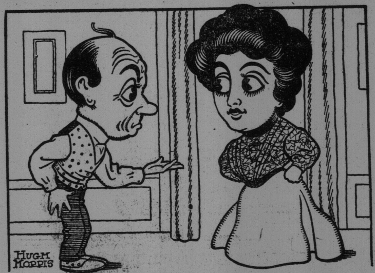
THE SUPERIORITY OF MAN. Wife (to husband after his long session in the cellar)—were the pipes frozen, dear? Hubby—No, the water in the pipes was frozen. That was all.

Do They Bother You? You find life a miserable affair because you have headaches, but you have neither nausea nor are you weak—You know if you could only prevent headaches you would enjoy perfect health.