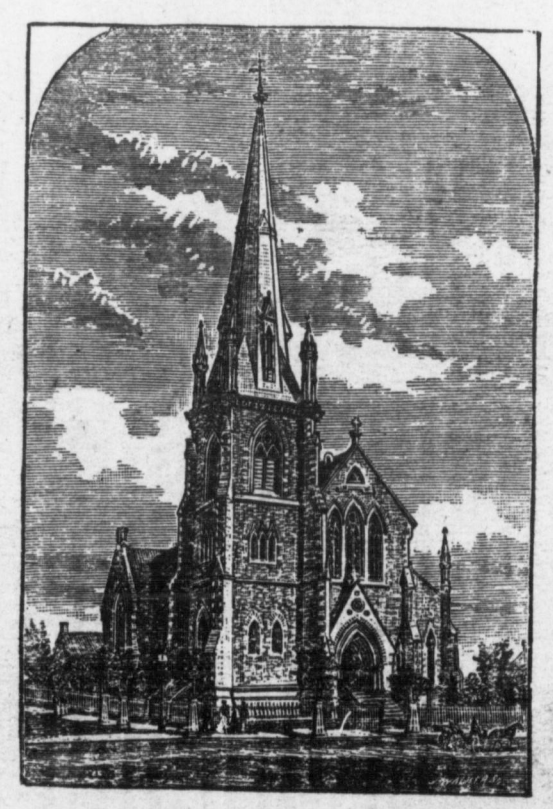
THOBURN & Co., PRINTERS, 36 ELGIN ST. OTTAWA. 1896.

Published by order of the Annual Meeting of the Congregation held 2nd March, 1896.