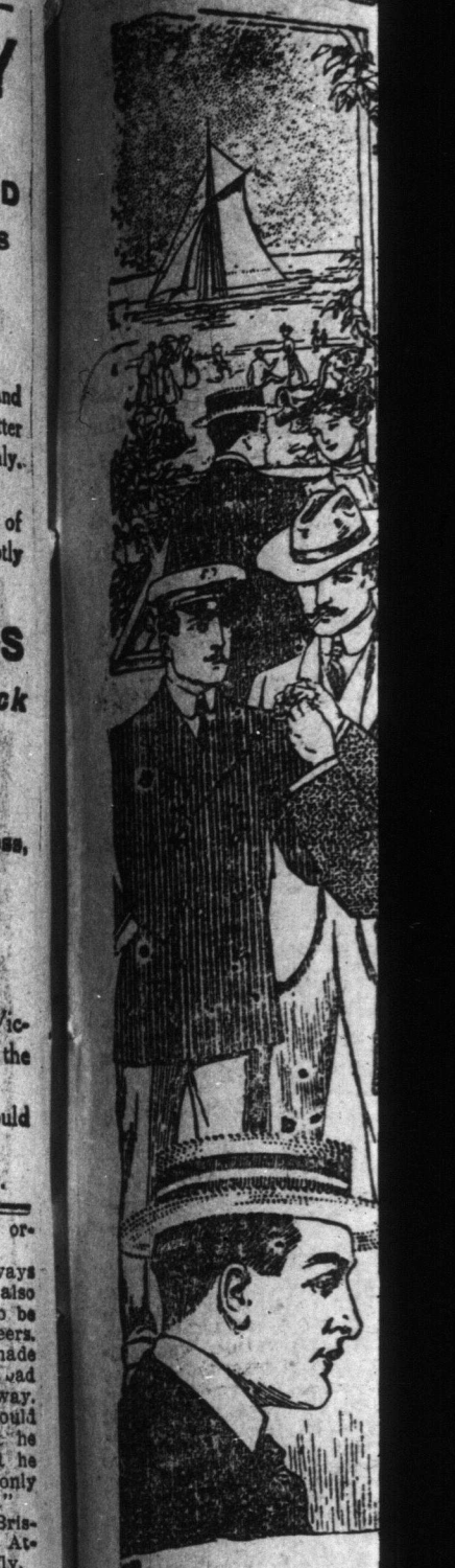
lutely nothing such thing

Some time must necessarily elapse before the railway companies can revise and reprint their numerous tariffs, but it is to be lost in getting this with this work.