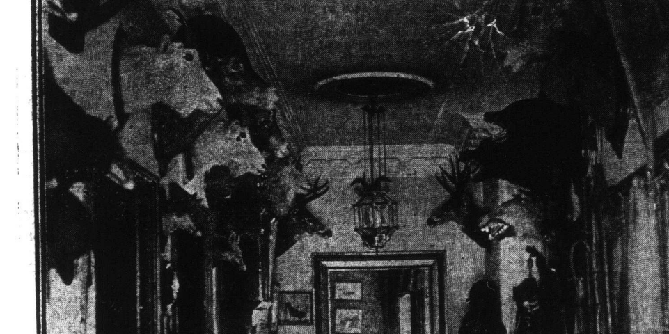
TROPHIES OF THE CHASE IN B. C.

"Yes, the doctor has put me on the strictest kind of diet." "Indeed. What I st?" "Well, he says I musn't eat anything I don't like, and not any more than I want of what I do."—Baltimore News. Subbubs—"You just ought to see my crop of corn! It's the most prom'sing in all the Lonesomhurst district." Townley—"You thing I don't say? If you have more than two messes don't forget me, will you?"—Pu k.