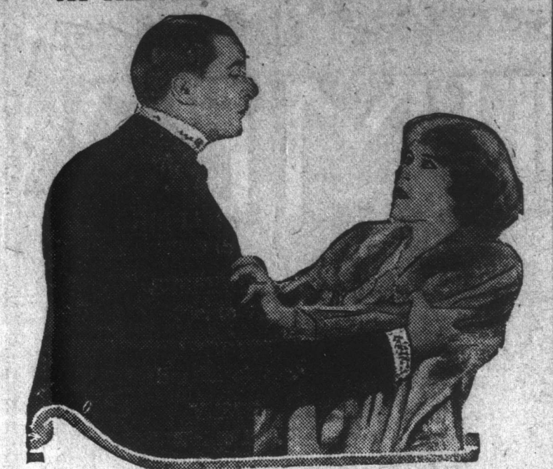
MAE MURRAY in "BROADWAY ROSE"